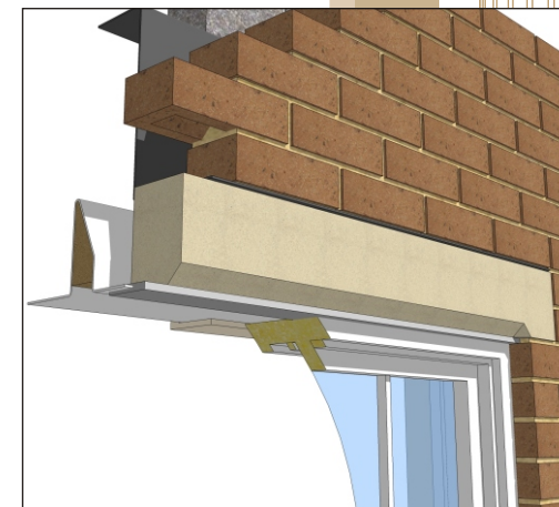
Typical installation detail

Our Heads are non structural and should be used in conjunction with supporting lintels. They are available to fit standard openings or a bespoke opening to your request. Internal Stainless steel reinforcing and lifting lugs can be cast in to order. If you require any further information, please call 01258 472685 and ask to speak to a member of our technical department All joints shown 6mm